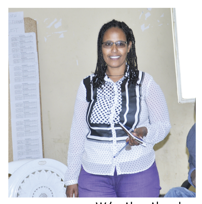
W/ro Abay Akmachew Director for Gender & HIV/AIDS Prevention and Control Directorate

The trainees discussed on issues of how the media represent women, persons with disabilities and HIV positive in magazine ,film, drama, advertisements and media. Besides the discussion deeply analyzed the way to what extent the experts understand the crosscutting issues and to what extent the media use neutral words to raise issues of gender, disability and HIV/Aids.